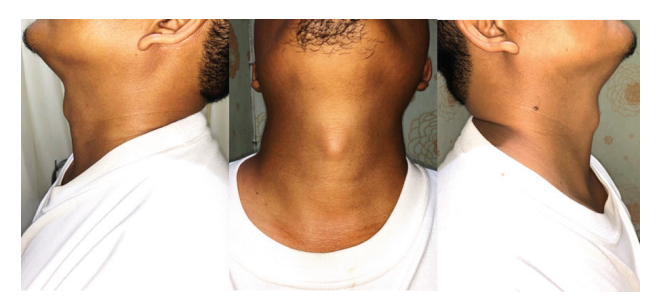
Figure 4. A 44 years old man after 1 week PEA procedure